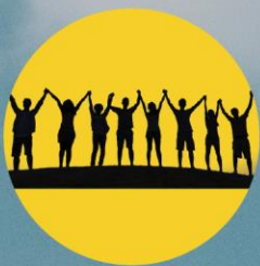
A COMMUNAL SPIRIT