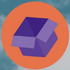
SLU JOURNEY BOX